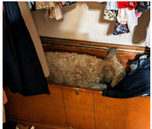
I need my beauty sleep!