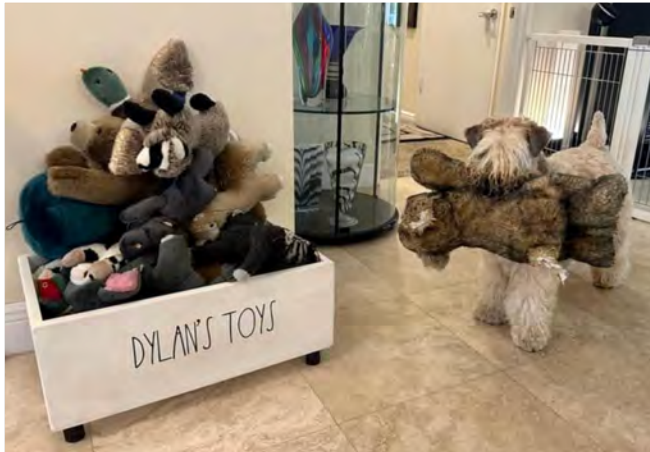
One can never have too many toys!