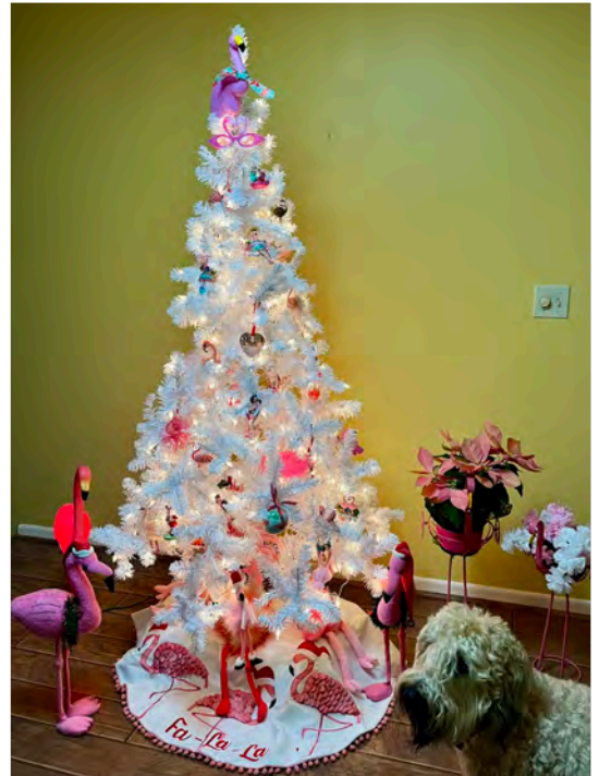
Plotting the destruction!