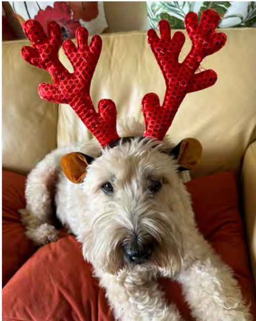
Waiting for Santa!