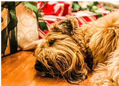
Visions of sugar Plums

SOFT COATED WHEATEN TERRIER GROUP OF GREATER TAMPA BAY